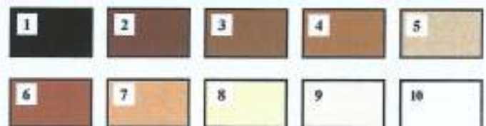
Colour chart for describing soil colour in Context Record Sheets box 6.

When you've finished digging the context (unless you encounter other features, context 1 will finish at 10 cm down from the surface, context 2 will finish at 20 cm down, context 3 at 30 cm etc.), fill in boxes 5, 6 and 7 on your Context Record Sheet . For box 6 fill in the number(s) from the colour chart (at top