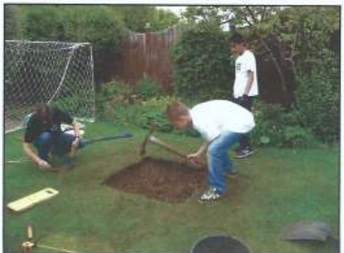
Using a mattock safely and effectively.

To use the mattock most effectively: hold the handle and drop it gently but firmly into the soil using the weight of the tool to do most of the work for you! You're aiming to embed the blade no more than about 5 cm into the soil. Once you've done this, lever it up or pull it towards you to loosen the soil.