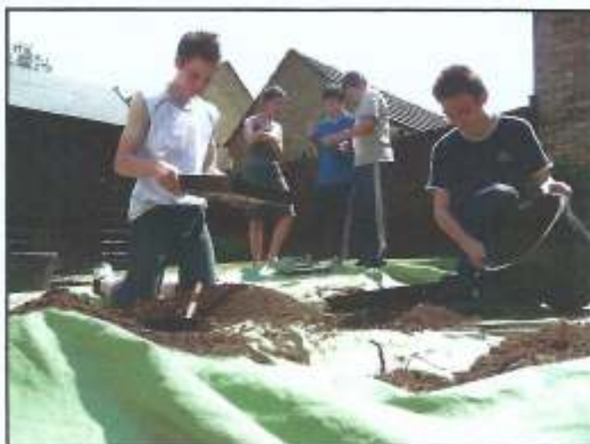
Sieving the contents of a test pit.

Sieve all of the soil as it is excavated and keep anything and everything that you think might be manmade or interesting for some other reason. These are your finds! Pottery, bone and metal are the most common finds in test pits and you should keep stone if you think it's been used by someone.