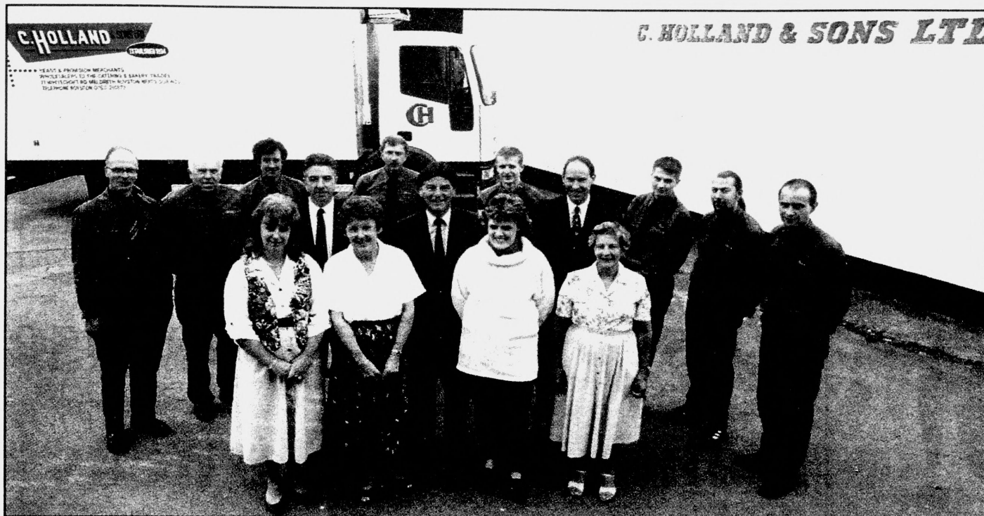
Loyalty pays off . . . Holland attributes much of its success over the past 100 years to its loyal workforce. 5327943A